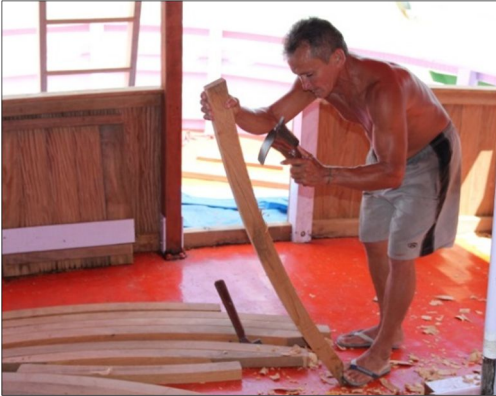
Carpenter works on medical boat

The purchase price of the boat is $60,000 and the cost to adapt the boat for medical use is an additional $15,000. God has blessed us with donors who have covered the $60,000 purchase price. Now we are raising the funds for remodeling. We need to add a medical room, a dental room and 2 bathrooms on the lower deck. We have already started to raise the roof on the top deck from 5'8" to 6'5" to accommodate taller team members.