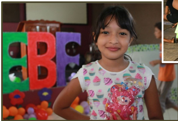
VBS - Castanhal