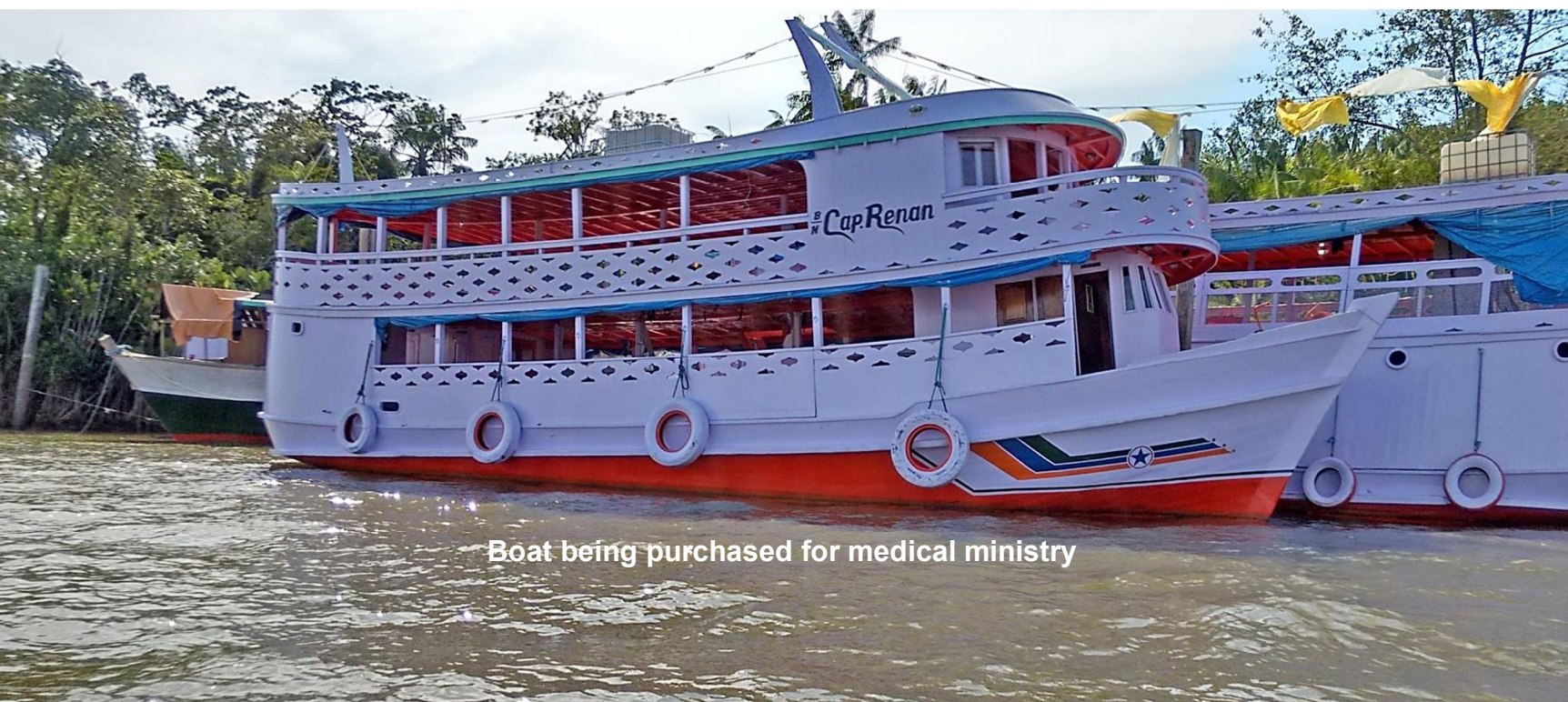
Boat being purchased for medical ministry