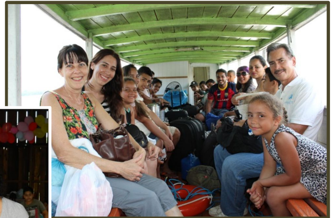
Youth Camp travel