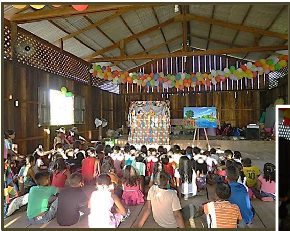
VBS –Bujaru Church

The church was blessed this year with 3 baptisms, 2 youth camps, and 2 Vacation Bible Schools. We were able to use the ministry boat to make trips to the village of Conceição near Bujaru, giving out clothes and Bibles and visiting with the people to invite them to church.