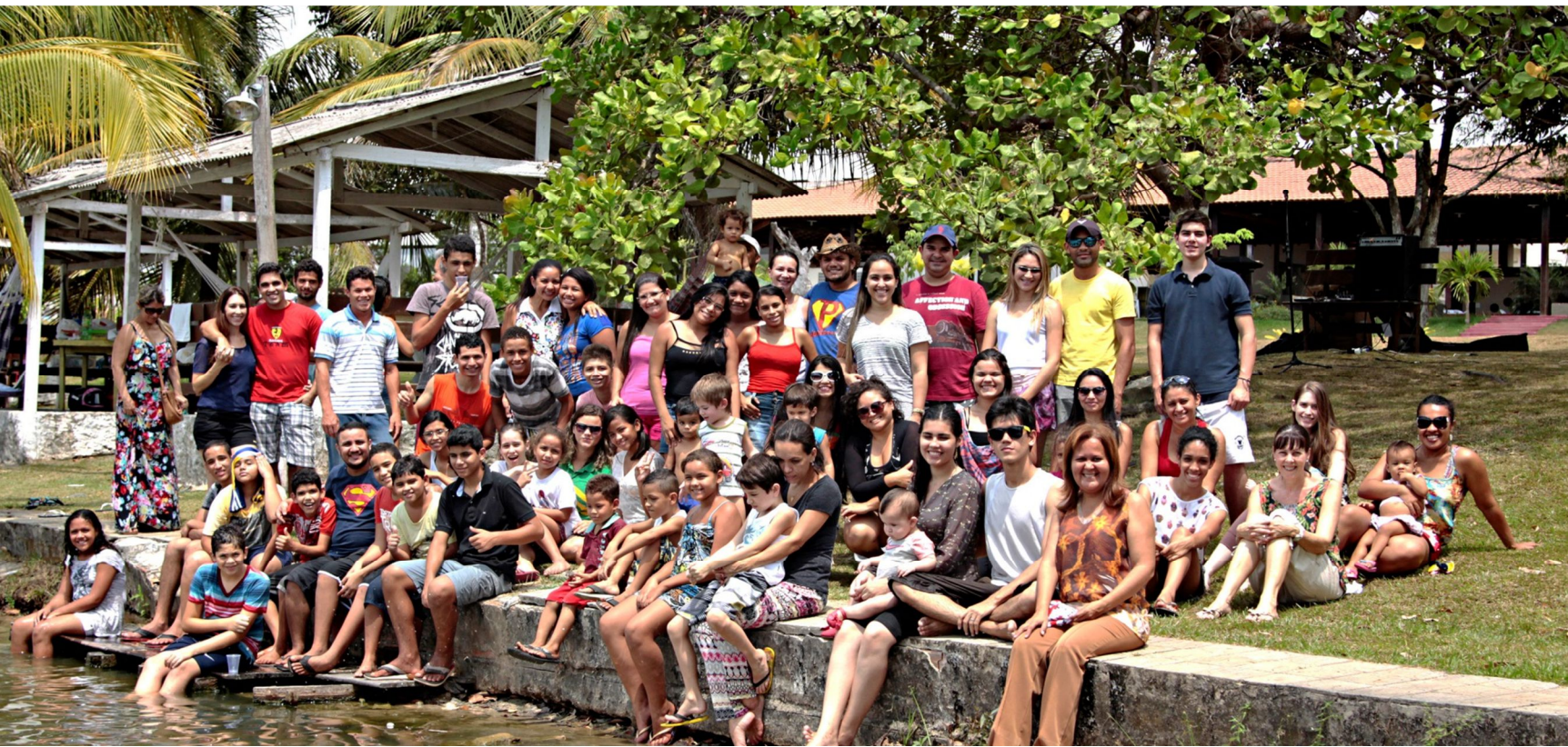
Castanhal Church gathers at lake for baptism