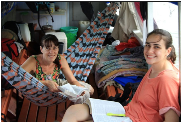
Travel by River Boat

At the same time as God opened the doors for the purchase of the medical boat, our small mission boat was completed and ready to use on long trips. We were able to make a trip 65 miles up the Guama and Capim Rivers to see firsthand what the needs are for churches and health assistance for the river people. We found out that the rivers are very heavily populated with no facilities for health care and many areas with no Christian church. There are so many people to reach with the love of Jesus!