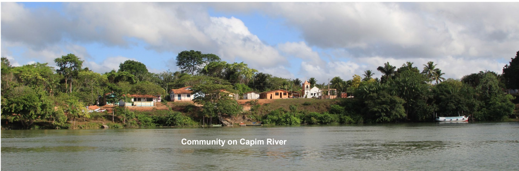
Community on Capim River