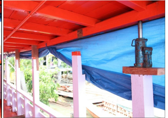
Raising roof of top deck