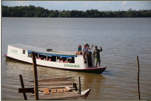
Youth making visits along the Guama river

The vacation Bible Schools were followed by a four day youth camp. Once again, the highlight of the camp was the day of making visits to the families along the river. The camp theme emphasized that when we are on fire for God, we will light those around us with the same fire that is in our own lives.