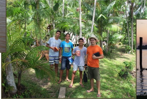
Team of 4 youth go out to minister

The vacation Bible Schools were followed by a four day youth camp. Once again, the highlight of the camp was the day of making visits to the families along the river. The camp theme emphasized that when we are on fire for God, we will light those around us with the same fire that is in our own lives.