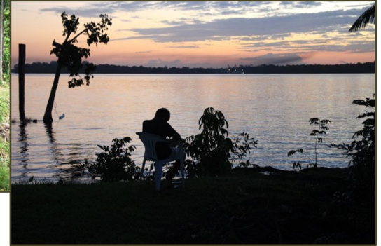
Time alone with God at youth camp