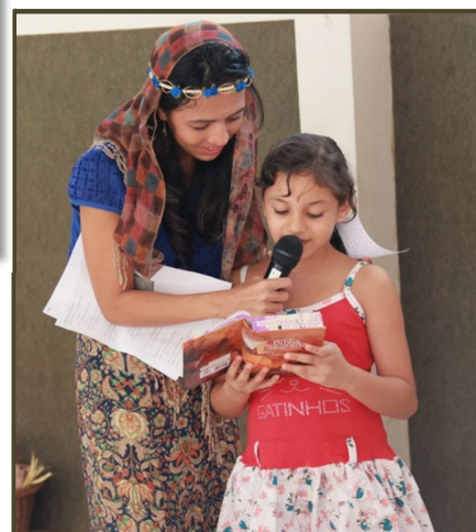
Reading about a Bible hero - VBS in Castanhal

The theme for our Bujaru river church Vacation Bible School was “Heaven is Real” . Seventy-five children from our Bujaru river church and the surrounding villages participated in 2 full days of songs, Bible Stories, puppet shows, games and snacks.