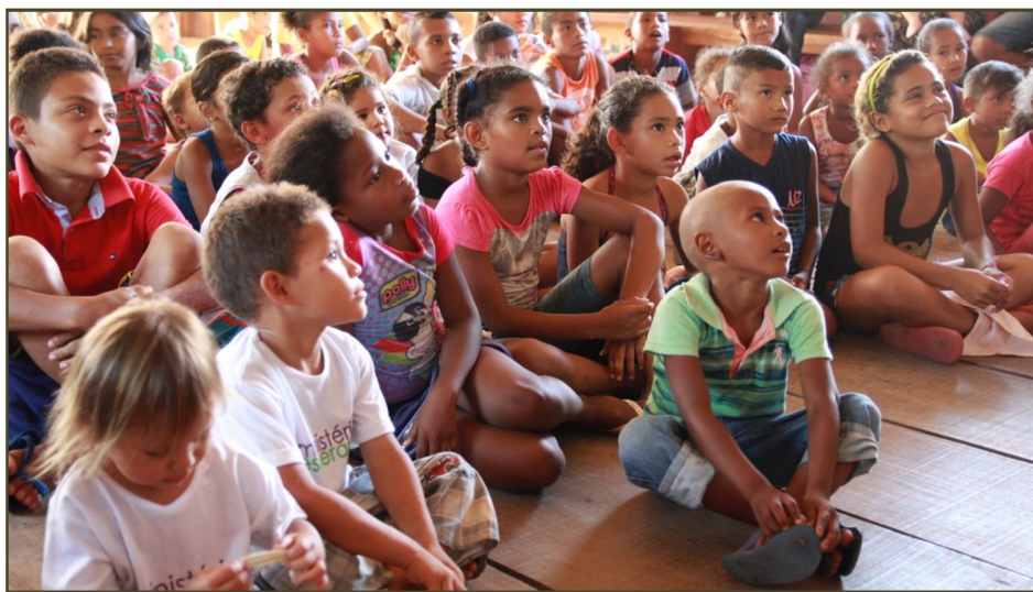
Children listening at Bujaru VBS

In our Castanhal church, the VBS (Vacation Bible School) theme was “Bible Heroes.” The children learned the stories of David, Ester, Deborah and Daniel. You can see how attentive all the children were!