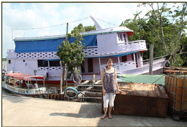
Medical boat at boat yard in Abaetetuba

After 8 months of praying, planning, your many generous donations and much hard work, our boat is ready! This first week of September we will be picking up our medical boat from the boat yard where it has been remodeled and will be piloting it to our Bujaru church. A team from Fields of Harvest Church in Texas is arriving to accompany our maiden voyage with the boat. We will also be visiting strategic communities along the river to open doors for new churches to be planted. God has provided a team of a doctor, 2 nurses, 2 medical students and 3 nursing students to do clinics in the villages that we visit. Through your gifts we have purchased medicines and Bibles to give out to the people that come to the clinics.