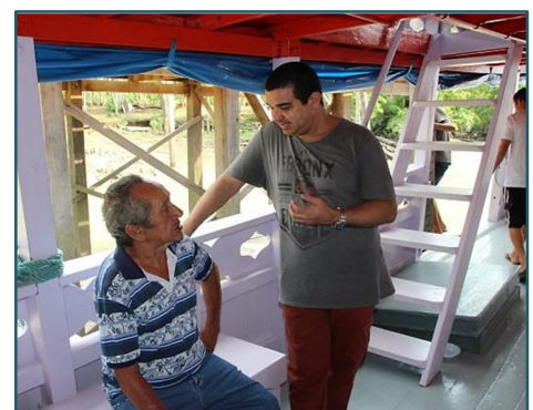
Patient receives prayer and counsel while waiting for doctor