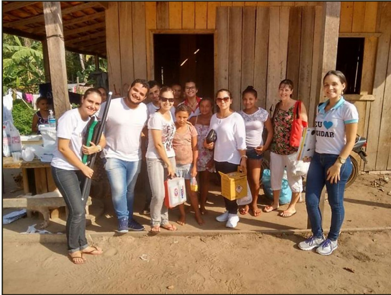
Nursing and dental staff making home visit at Conceição

The last week of October we held nursing and dental clinics in the communities of Bujaru and Conceição. Our staff included nurses, nursing students and a dental student. We were able to see 40 patients, hold workshops on hygiene and water treatment and give fluoride treatment to all the children that came. Behind each smiling face there was a story of broken homes, absent parents, abuse, and often drug involvement. Only Jesus can change the living situations of these beautiful children and young people and raise up a generation with a new hope of freedom from the vicious cycle that their families have been enslaved in.