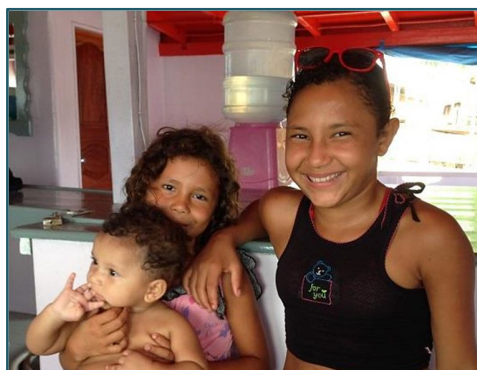
Children waiting to be seen by doctor