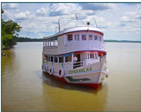
Medical Boat arriving at river community

Among the most serious cases we saw during our clinics was a 5 year old boy who had broken his foot 3 months ago. A local health facility had sent him home twice with no treatment. The bones have now healed crooked leaving him with a bad limp. Our medical staff was able to make a special appointment for him in a hospital in the capital city of Belem where he will be able to have surgery to correct his foot. There was also a 13 year old girl with complications from a miscarriage she had 2 months ago when she was only 12. The staff was able to give her medical treatment and counsel.