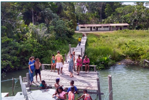
Arriving at Alegre Vamos with the school in the background

It is impossible to express the joy we felt after 7 years of praying and planning plus 2 years of purchasing, remodeling and registering the boat and then to go back and see the excitement of the people as they said, "You didn't forget about us!"