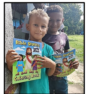
Two small boys from Alegre Vamos receive Bible story coloring books

While the team was there, the people of Alegre Vamos finished the dock for our medical boat and are now ready for a church building.