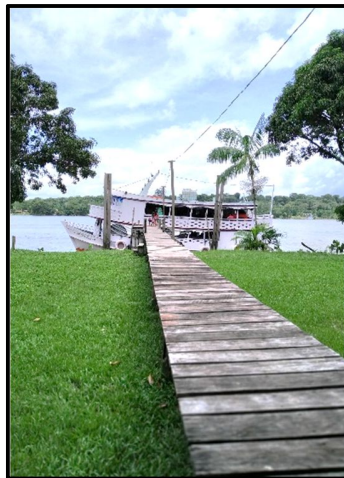
Medical Boat docks at Paritá