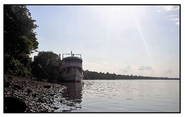
Medical Boat docks at Mocajuba for Children's Day project.

While many places in the world continue to struggle with covid lockdown and fear of "returning to normal" we praise God that covid has almost died out in our area of Brazil. God has once again opened the doors for ministry in our Castanhal church and all along the river tributaries. Our churches are fuller than before the pandemic, the medical boat is going out again for clinics and dental treatment and now this weekend we are hosting a youth camp. We can only praise God for this window of opportunity to share His Word here and ask that each day would be one of growth for His Kingdom.