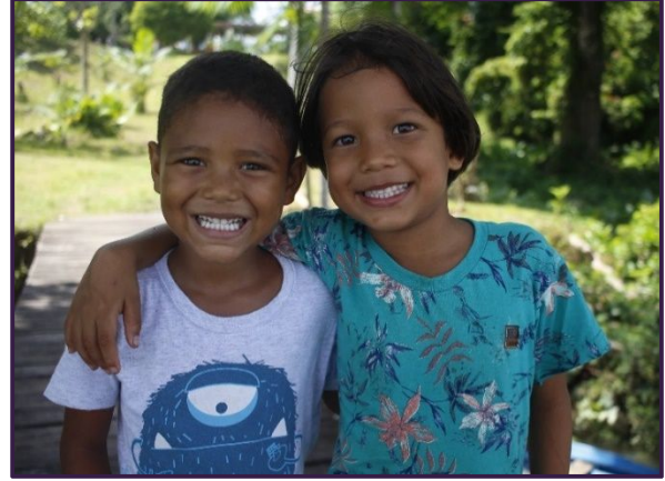
Mocajuba children come to meet Medical Boat on Children's Day