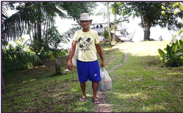
Elderly man from Mocajuba comes to clinic