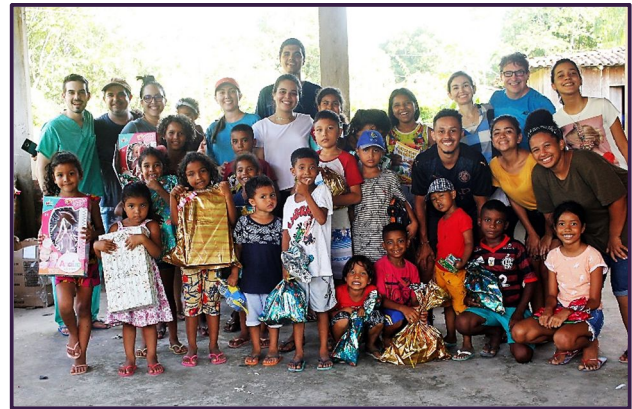
Mocajuba children receive gifts from team on Children's Day