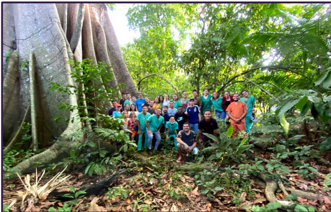
Medical Boat team next to giant Amazon hardwood tree at Mocajuba