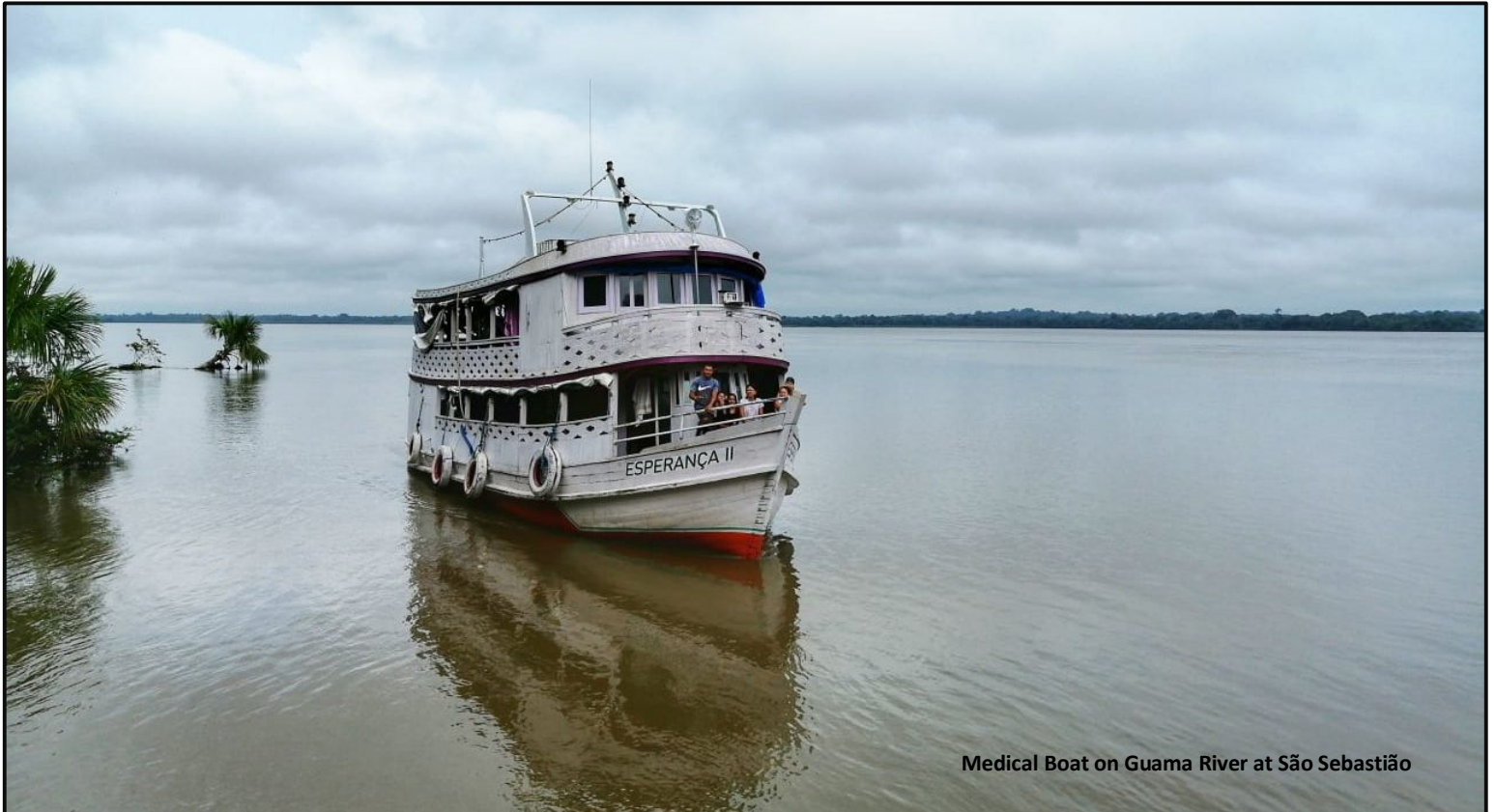
Medical Boat on Guama River at São Sebastião