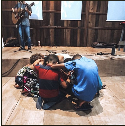
Prayer at youth camp

In February the youth from Castanhal Church held a camp for youth and preadolescents in Bujaru. Time was spent in Bible study and teaching the youth and children about prayer and evangelism. After times of prayer each day, the Castanhal youth took the Bujaru young people out to the surrounding neighborhoods and communities to evangelize and pray for the people they visited.