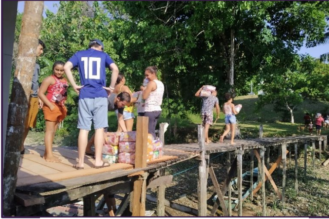
Medical Boat distributes food baskets at Mocajuba

In spite of almost 4 months of lockdown in our state of Pará, God enabled us to reach out to two new communities on the Guama River this year. The first is the community of Mocajuba , which is about 45 minutes down river by medical boat from our Bujaru Church. At the beginning of the year, we started a home church group in Mocajuba where we held meetings once or twice a week. In October we were able to hold a clinic for the community of Mocajuba where 70 medical and dental patients were treated. Since it was Brazilian Children's day, we also held a meeting for the community children. There were Bible stories, songs, a prayer time and gifts for the children.