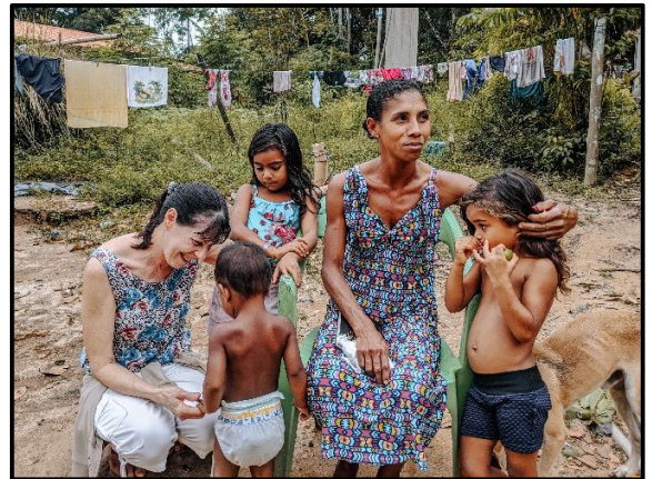
Sharing love and food basket with family in São Lopes

Our first mission trip this year was to the river community of São Lopes on the Guama River. Twice our medical boat had stopped at this community in 2020 when returning from Capim River trips and both times the people we met at the river edge begged us to come back and hold a clinic and a church meeting. On January 20 we were finally able to take a team of our church youth to get to know the community. Besides visiting many homes along the river, we walked to the community center about two miles inland. We gave out Bibles and shared the gospel with the people we met. Everywhere we stopped there were people asking for prayer. Returning to the river edge at about 4 PM there were over 40 people waiting where our medical boat was docked hoping to see a nurse and receive medicine. Everyone who came received treatment and we gave out 20 food baskets and more Bibles. God has opened another door to reach one more community with His love and His salvation!