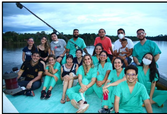
Dental and medical team return from clinic at Alegre Vamos