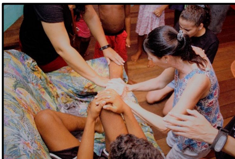
Praying for boy with poisonous snake bite

Over the next two months, we were able to make 3 more trips to São Lopes, holding clinics and making more visits. On one of our trips we prayed for a boy who was bitten by a poisonous snake. The boy had received anti venom treatment at a hospital in the city but his leg was swollen and he could not walk. We also prayed for a man who was suffering from depression for 6 months after the death of a friend. When we returned on our next visit, the boy's leg was completely healed and the man said that he was set free when we prayed for him.