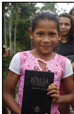
Center -girl at São Lopes receives Bible

There are so many people here that need the Lord and the answers that only He can give!