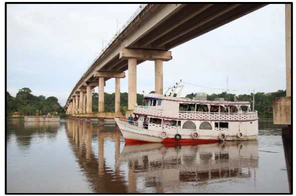
Medical Boat passes under bridge on the way to Alegre Vamos

On each trip God provided volunteer staff - a doctor, nurses, dentists and a physical therapist as well as nursing and dental students. Six dentists were able to go in April and in one day saw nearly 100 dental patients!