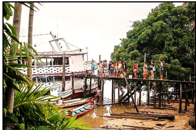
Patients line up at dock at São Lopes for clinic on medical boat

Over the next two months, we were able to make 3 more trips to São Lopes, holding clinics and making more visits. On one of our trips we prayed for a boy who was bitten by a poisonous snake. The boy had received anti venom treatment at a hospital in the city but his leg was swollen and he could not walk. We also prayed for a man who was suffering from depression for 6 months after the death of a friend. When we returned on our next visit, the boy's leg was completely healed and the man said that he was set free when we prayed for him.