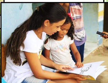
Little girl receives gift of coloring book