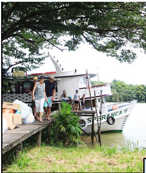
Unloading clothing and gifts at Taperinha