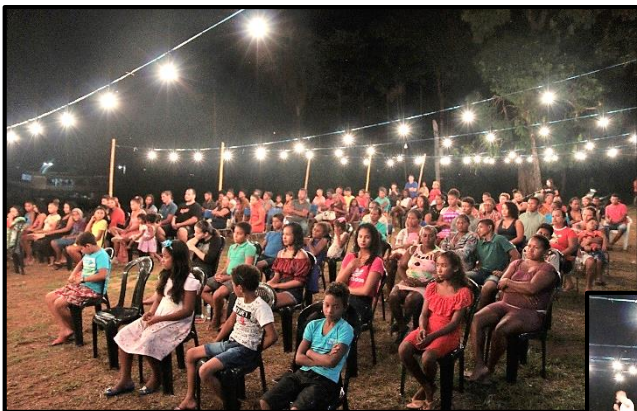
Revival Nights Crusade at Alegre Vamos