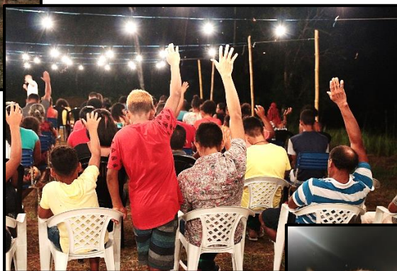
Answering the call to follow Jesus