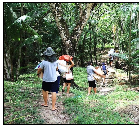
Carrying clothing along the trail to Taperinha