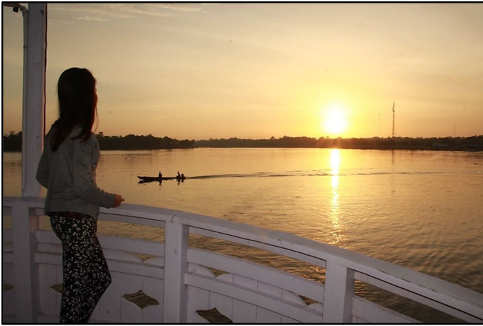
Medical Boat travel on Capim River