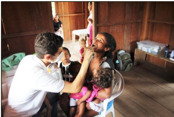
Dentist checks mother with 2 children