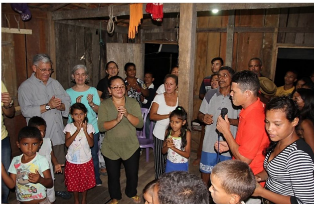
Home meeting at Church plant in Conceição

We were able to start weekly church meetings in 2 new communities this year. In both Açú and Conceição, the churches are meeting in believer's homes and we are praying for funds to start the church buildings. In Itabira we are still praying for a church worker to start the meetings there. On the Moju River we continue to pray for open doors to start meetings and for land for a church building.