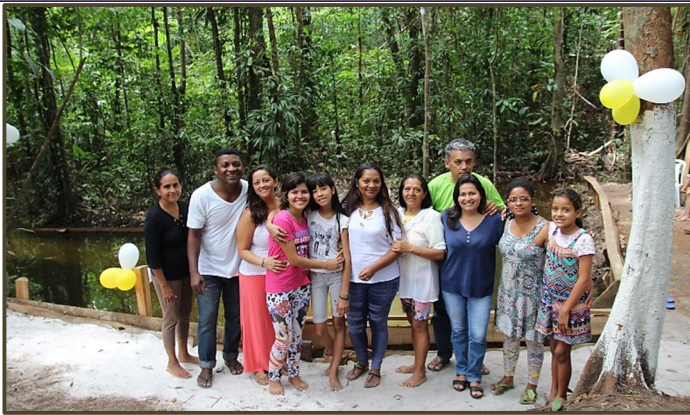
11 new believers baptized in Açú