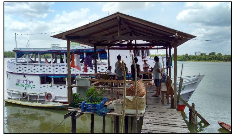
Medical Boat makes visit at Livramento on Capim River

So far our medical boat has made 2 trips up the Guama and Capim Rivers. We have set up sites for future clinics in 5 communities. Each place we go, there are open doors to share the gospel. We have been able to give out Bibles, Gospels of John and used clothes. Each community we stop at, the people have readily opened their homes to have a church service.