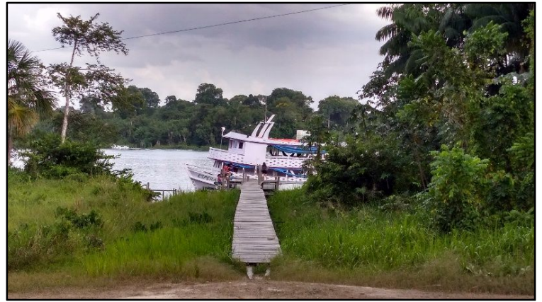
Medical Boat at São José on Capim River