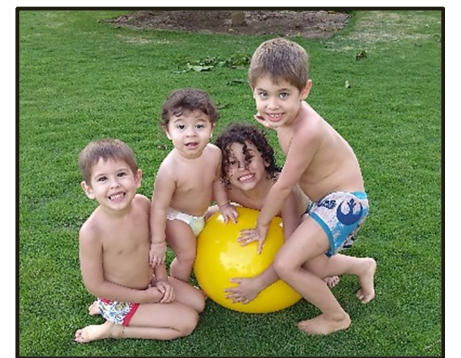
Four precious grandsons