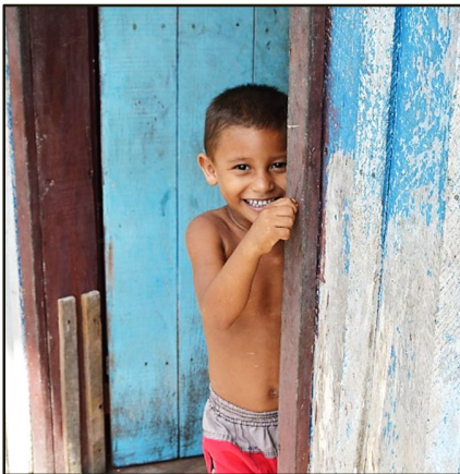
Little boy on the Moju River

In August we were able to make an awesome trip up the Moju River in our medial boat. Along with a ministry team from Texas, we traveled 24 hours up river – 11 hours further than we had traveled on any previous trip. Our desire was to see what the extent of the populated area on the river is in order to pray and see where God would lead us for future church plants. We followed the river through the last communities until the jungle ended and the land turned into farming plantations. At that point the river became too shallow to go further but we were able to count at least 15 communities in need of a church. Our team