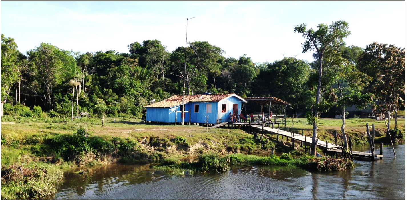
Vila Cruz home where we held a clinic on the upper Moju River

In August we were able to make an awesome trip up the Moju River in our medial boat. Along with a ministry team from Texas, we traveled 24 hours up river – 11 hours further than we had traveled on any previous trip. Our desire was to see what the extent of the populated area on the river is in order to pray and see where God would lead us for future church plants. We followed the river through the last communities until the jungle ended and the land turned into farming plantations. At that point the river became too shallow to go further but we were able to count at least 15 communities in need of a church. Our team