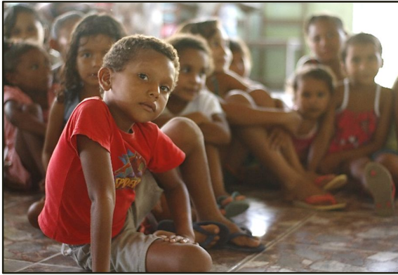
Listening to the Bible story

This summer was also a time of reaching out to children in the communities where Hope Ministries is working. Teams of our young people and church workers held six Vacation Bible Schools. Four were in our churches in Castanhal, Bujaru, Pio12 and Açú and the other two in new communities where we are holding clinics on the Capim River. The theme of the Vacation Bible Schools was the verse “I will build my church and the gates of hell will not prevail against it.” Matt 16:18