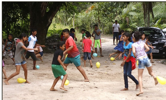
Games at VBS in Açú