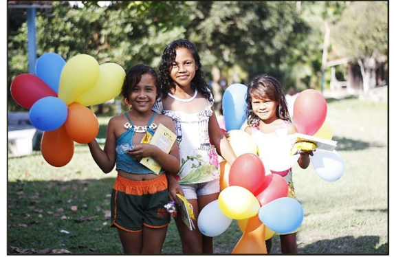
VBS Children taking home balloons and Bible storybooks

This summer was also a time of reaching out to children in the communities where Hope Ministries is working. Teams of our young people and church workers held six Vacation Bible Schools. Four were in our churches in Castanhal, Bujaru, Pio12 and Açú and the other two in new communities where we are holding clinics on the Capim River. The theme of the Vacation Bible Schools was the verse “I will build my church and the gates of hell will not prevail against it.” Matt 16:18