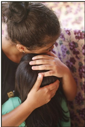
Love and prayer

There were skits, songs, games, puppet shows, creative activities and refreshments. Over 300 children heard the gospel message and each child was ministered to with love and prayer. It was so beautiful to see them respond to the love of Jesus – some with attentive interest, others with glowing smiles and others with tears in their eyes as they received prayer. Many of them prayed to receive Christ. We also gave out tracts, Bibles and Bible story books.