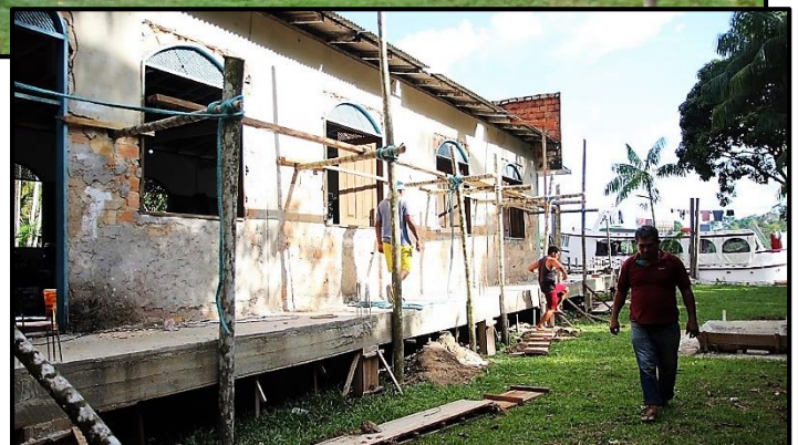
Repairing Paritá Church walls

The team from Texas spent 9 days living on the medical boat. While they worked on the church construction, Deborah, along with other nursing staff held daily clinics for the people along the river. Two of the most serious patients were a lady whose legs were covered with 3 rd degree burns and a 13 year old boy who needed stitches when a metal rod perforated his mouth.