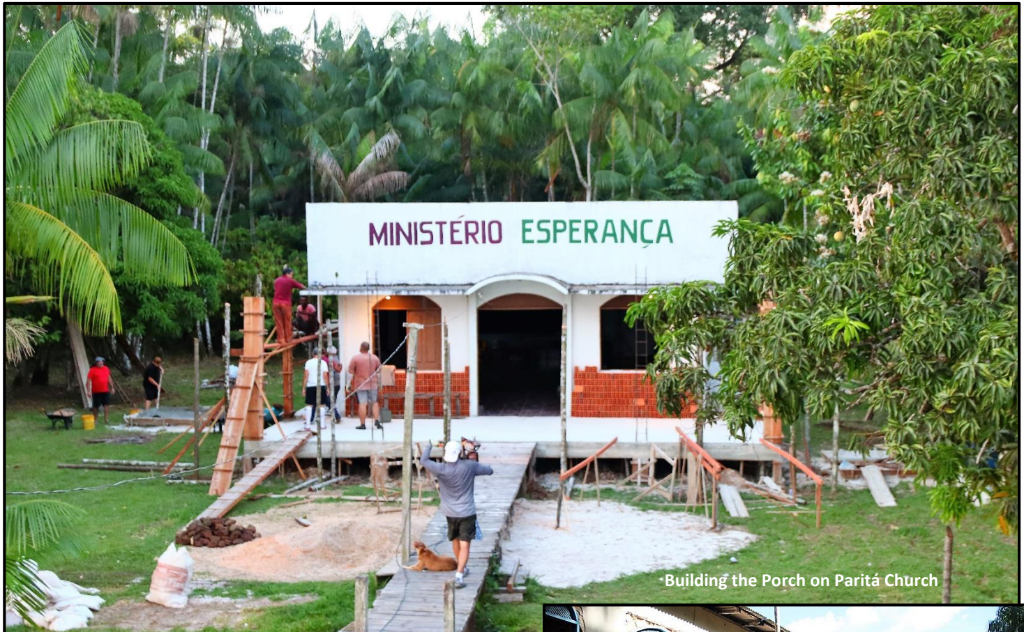
-Building the Porch on Paritá Church