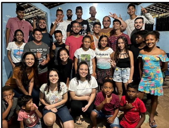
Youth meeting at Alegre Vamos

God has been faithful to His promise. This year we were able to hold over 40 clinics along these three rivers, treating hundreds of patients- children, mothers, elderly and anyone in need. We took teams of dentists, doctors, physical therapists, nurses and church workers to minister to the patients. This medical ministry has opened doors for holding evangelistic meetings, home groups and for the beginning of two new churches.