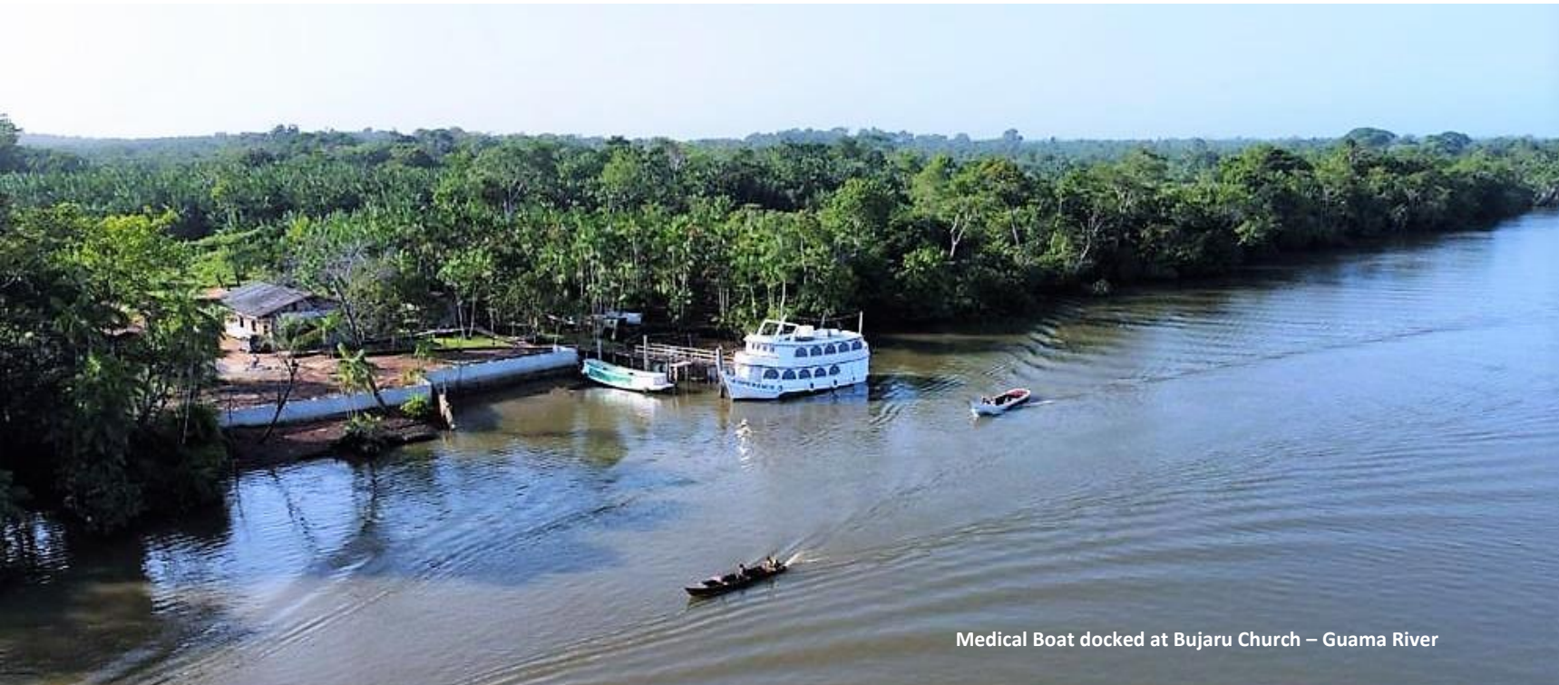
Medical Boat docked at Bujaru Church – Guama River

“So shall my Word be that goes out of My mouth: It shall not return to Me void...” Isaiah 56:11