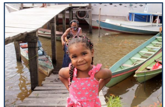
Little girl arriving at clinic in Alegre Vamos

This year God has provided funds for starting our church building in Alegre Vamos on the Capim River. The land donated for the church has been cleared and is ready for building now in 2022. The Alegre Vamos Church will also be a base to reach out to 7 more nearby river communities.