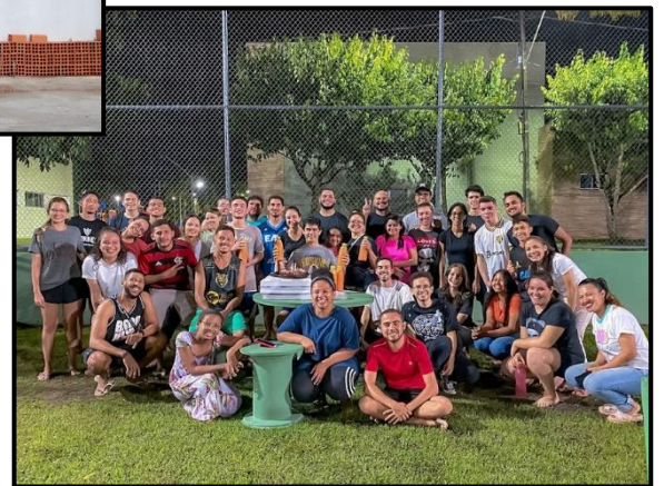
Below - Castanhal Church youth group