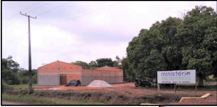
New church building going up in Açú