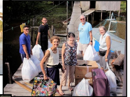
Distributing used clothes and food baskets at São Lopez