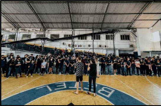
Hungry Generations evangelism in Castanhal schools