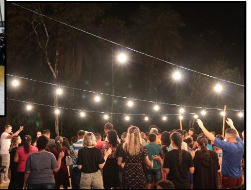
Revival Nights at Alegre Vamos