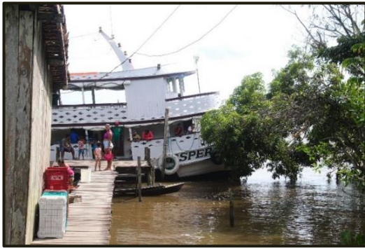
Medical Boat at São Lopes