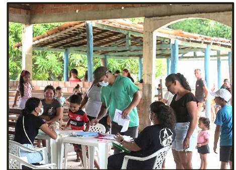
Medical Boat clinic at Mocajuba