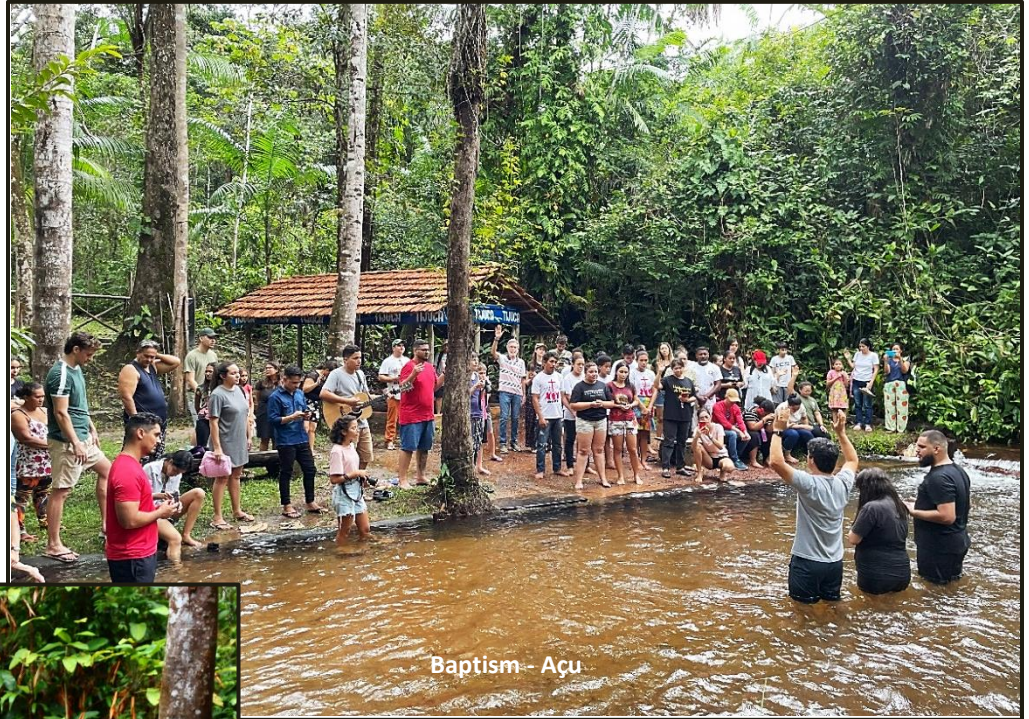
Baptism – Açu

This month of April we had baptisms for 14 young people from both our Castanhal church and our Açu church. There have been many new youth coming to church and God is working in a beautiful way to pour out His Spirit. They are being freed from emotional problems and addictions and are on fire to serve the Lord and to win their families and friends through their testimonies.