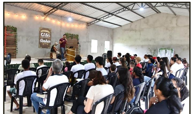
Saturday morning camp meeting

and slept on the unfinished floor of the church. They cooked their meals in the neighboring pastor’s house.