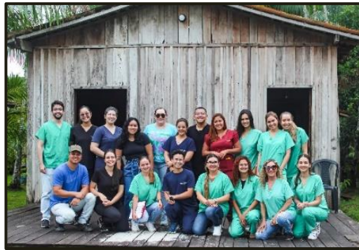
Medical Boat team at Bujaru